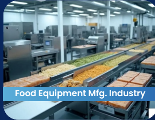
Food Equipment Mfg. Industry