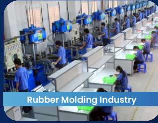
Rubber Molding Industry