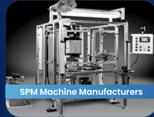
SPM Machine Manufacturers