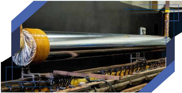
Hard Chrome Plating

ChromeWell Industries offers a comprehensive range of plating and surface finishing services designed to improve wear resistance, corrosion protection, surface hardness, and aesthetic appeal of industrial components.