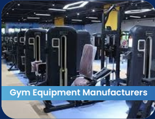
Gym Equipment Manufacturers