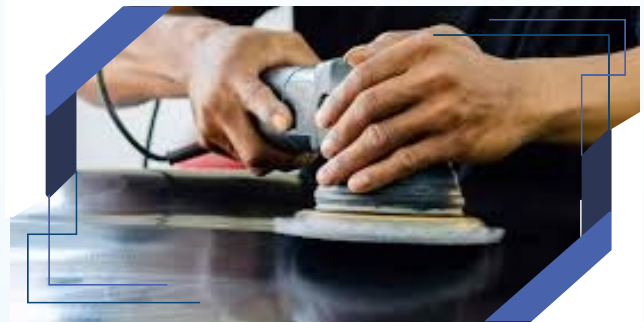
Buffing & Polishing