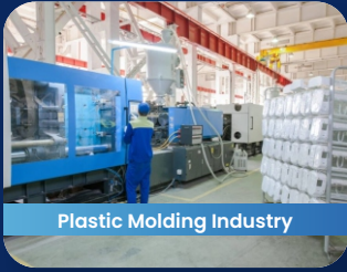
Plastic Molding Industry