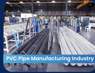
PVC Pipe Manufacturing Industry