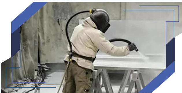
Glass Bead Blasting