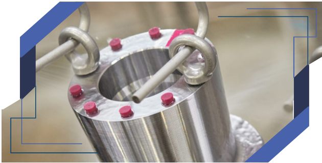
Electroless Nickel Plating