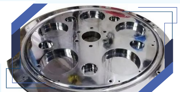
Die Polishing & Plating

Our processes are carried out using proven techniques and controlled parameters to ensure uniform coating thickness, superior surface finish, and long-lasting performance.