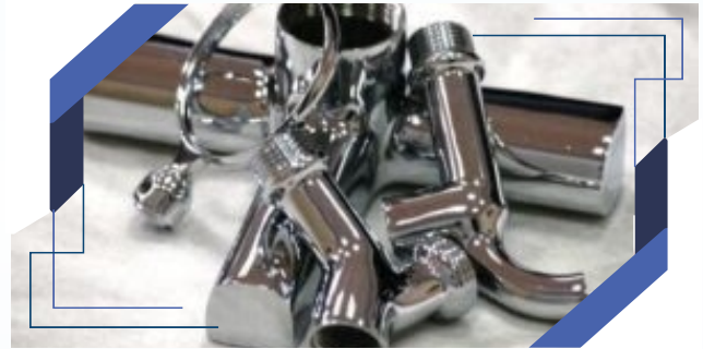
Nickel Chrome Plating