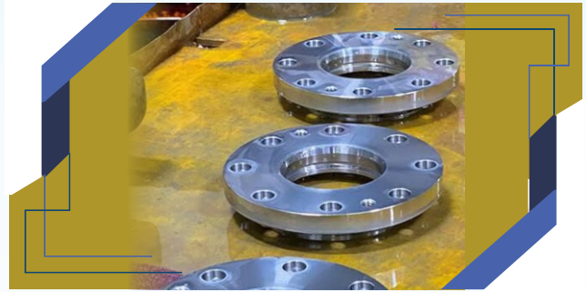
Flash Chrome Plating